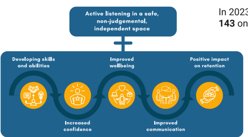
Key benefits of the programme

In 2023/24 we coached 44 prison staff through 143 one-to-one coaching sessions.