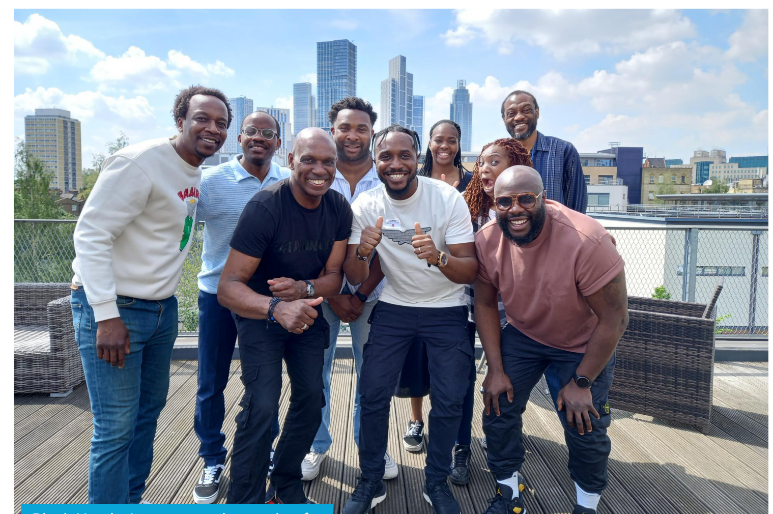
Black Hero's Journey coaches gather for training